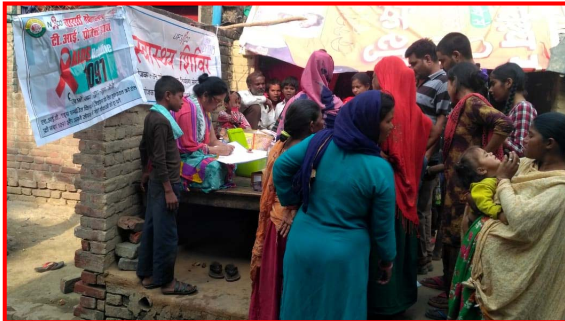
HEALTH CAMP MEETINGS